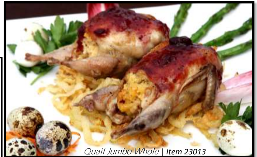
Quail Jumbo Whole | Item 23013