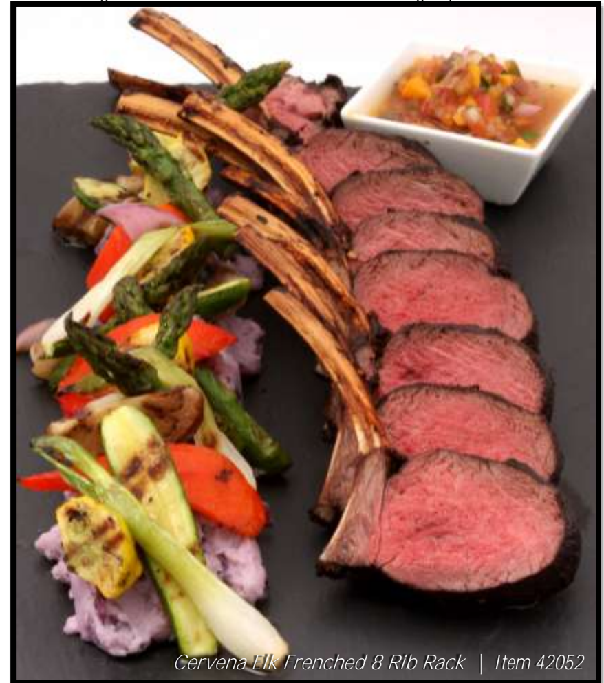
Cervena Elk Frenched 8 Rib Rack | Item 42052

New Zealand farm raised and grass fed Elk give a hint of rustic elegance to any menu. Rich yet subtle in flavor, these fabulous menu items range from frenched rib racks for center of plate presentation to portion controlled chops and medallions and ground items for out-of-the box burger plates.