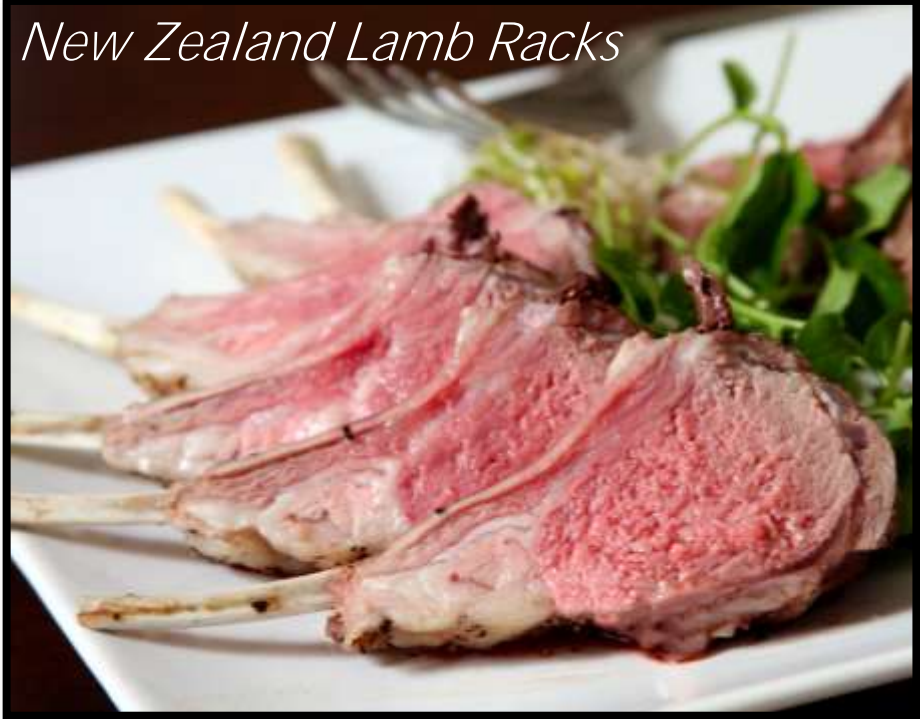
New Zealand Lamb Racks

NEW ZEALAND PASTURE RAISED LAMB *Family Farmed Free Range, Grass Fed Lamb, Never confined to a feedlot *No Added Hormones - Ever *Halal Certified 65214 Long Leg, Whole, Bone In, 40# avg. 65244 Short Cut Leg, Bone In, Chump Off, CKT 65262 Leg, EZ Carve, Bone In, 6/5# 65252 Leg, Boneless (Tunnel Bone) 65233 Top Sirloin, Cap Off 65296 Top Sirloin, Cap On 65543 Frenched 12-14oz Racks, 14/2pk 90692 NON-HALAL Frenched 12-14oz Racks, 14/2pk 65544 Frenched 14-16oz Racks, 12/2pk 90693 NON-HALAL Frenched 14-16oz Racks, 12/2pk 65545 Frenched 16-18oz Racks, 12/2pk 90694 NON-HALAL Frenched 16-18oz Racks, 12/2pk 65548 Frenched 18-20oz Racks, 12/2pk 65549 Frenched 20-22oz Racks, 10/2pk