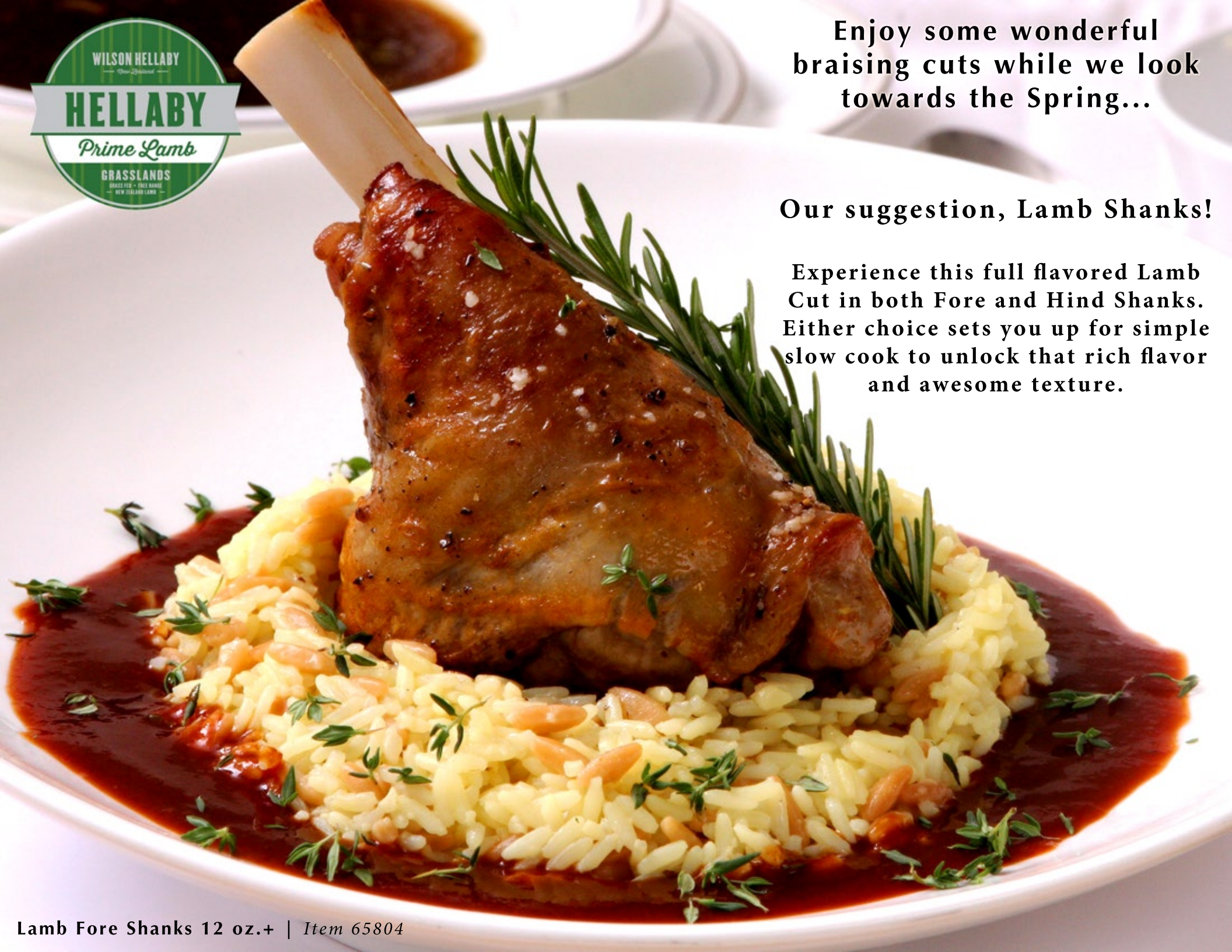
Lamb Fore Shanks 12 oz.+ | Item 65804

Experience this full flavored Lamb Cut in both Fore and Hind Shanks. Either choice sets you up for simple slow cook to unlock that rich flavor and awesome texture.