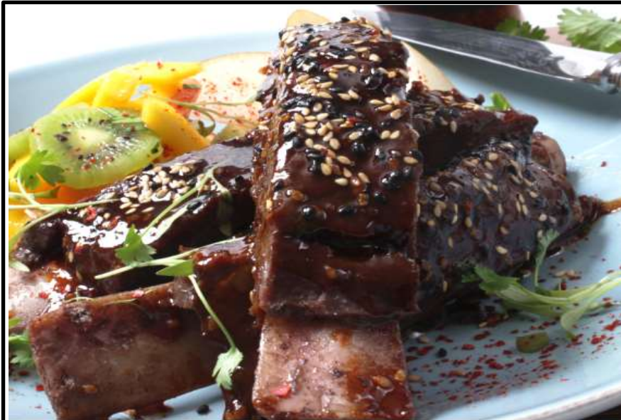
Cooked Venison Short Ribs | Item 84600