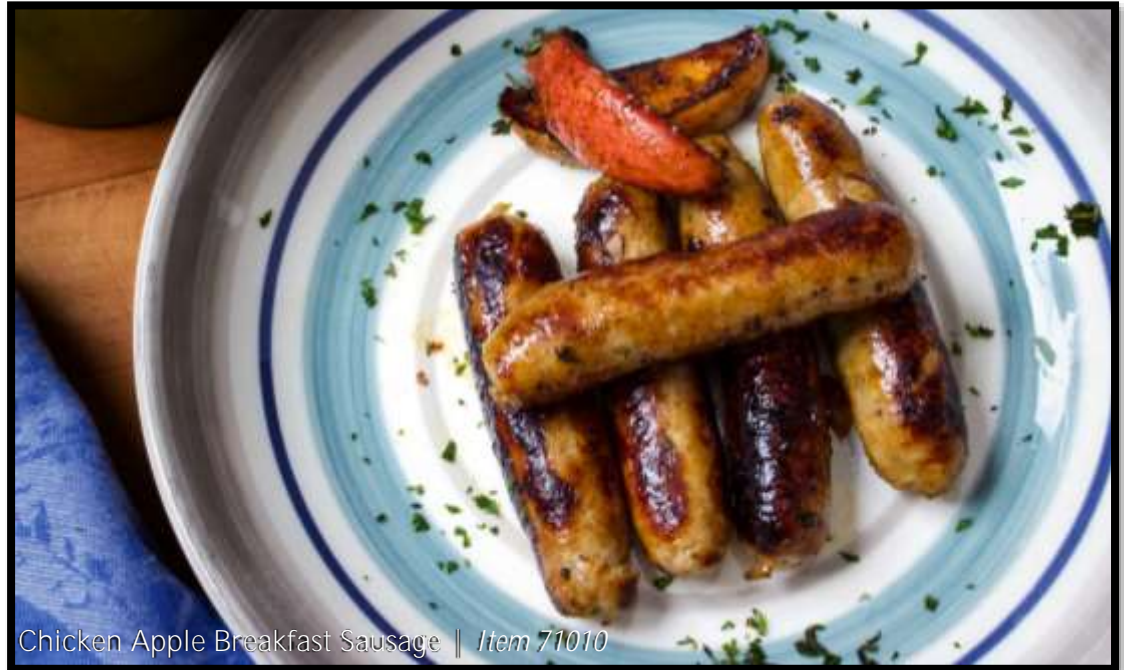
Chicken Apple Breakfast Sausage | Item 71010