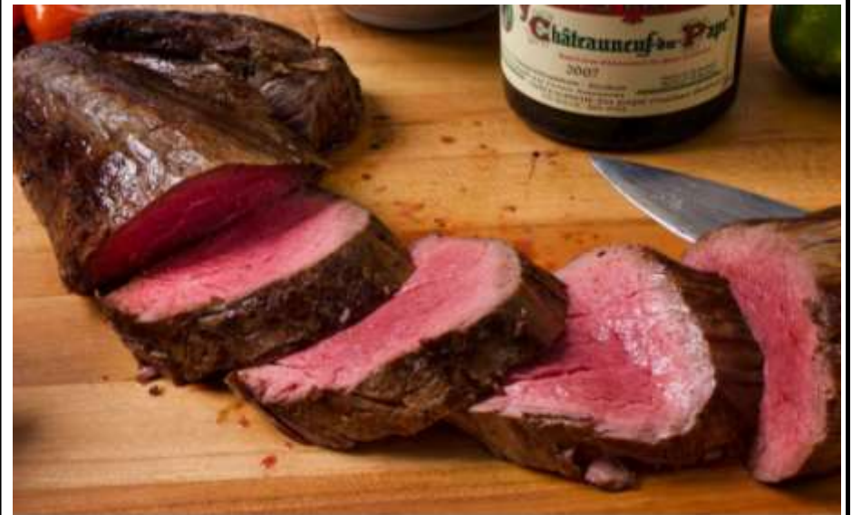
Bison Whole Muscle Tenderloin | Item 24262

Celebrate the New Year with an American Classic, fresh off the ol' Frontier