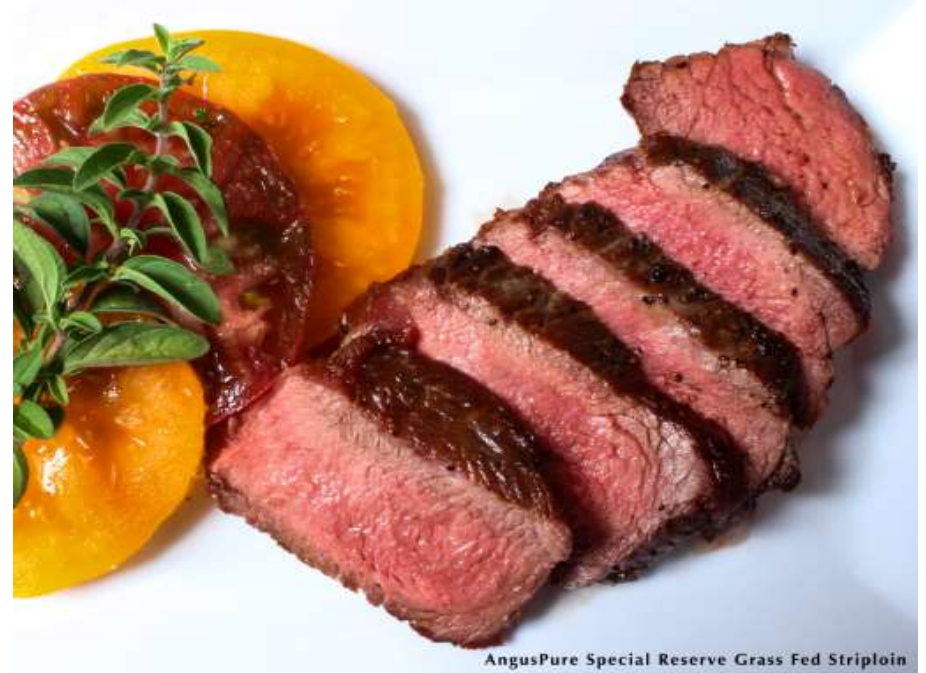
AngusPure Special Reserve Grass Fed Striploin