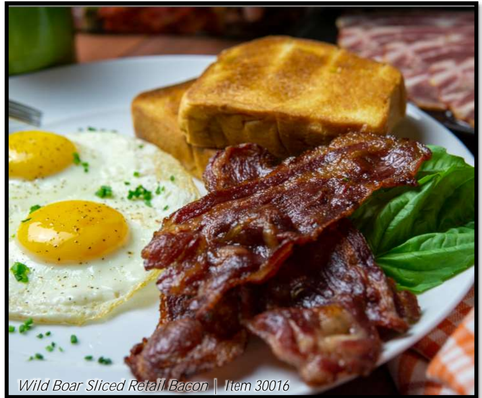
Wild Boar Sliced Retail Bacon | Item 30016

***UNLESS NOTED OTHERWISE, ALL PRICES ON THIS PAGE ARE PER POUND***