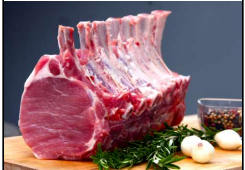
Kurobuta 8 Bone Rack

This outrageously juicy pork breed originated in Berkshire England. In the 19 th century England gave a shipment of these hogs as a gift to Japanese diplomats and called them "Kurobuta" meaning black pig for their black coat.